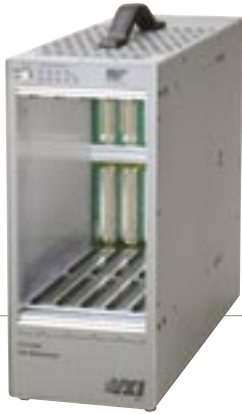
Front View of CT-310A