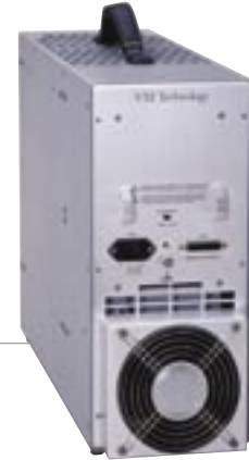
Rear View of CT-310A

Size: 21.3" deep x 7" high x 15" wide C-size, 5 VXIbus card slots Weight: 22 lbs VXIbus Revision: 1.4 Cooling: > 65 W/slot Rackmount Kit: Kit with rackmount ears and front door available to allow the CT-310A to be recessed in the rack for cable harnessing Input Voltage: 100 - 240 V ac, 50/60 Hz